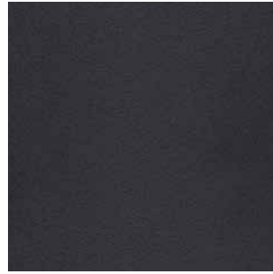
Dark Grey C38