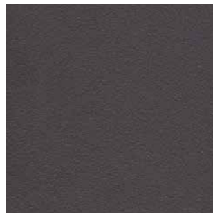
Medium Grey C37