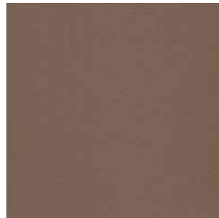
Medium Bronze C33